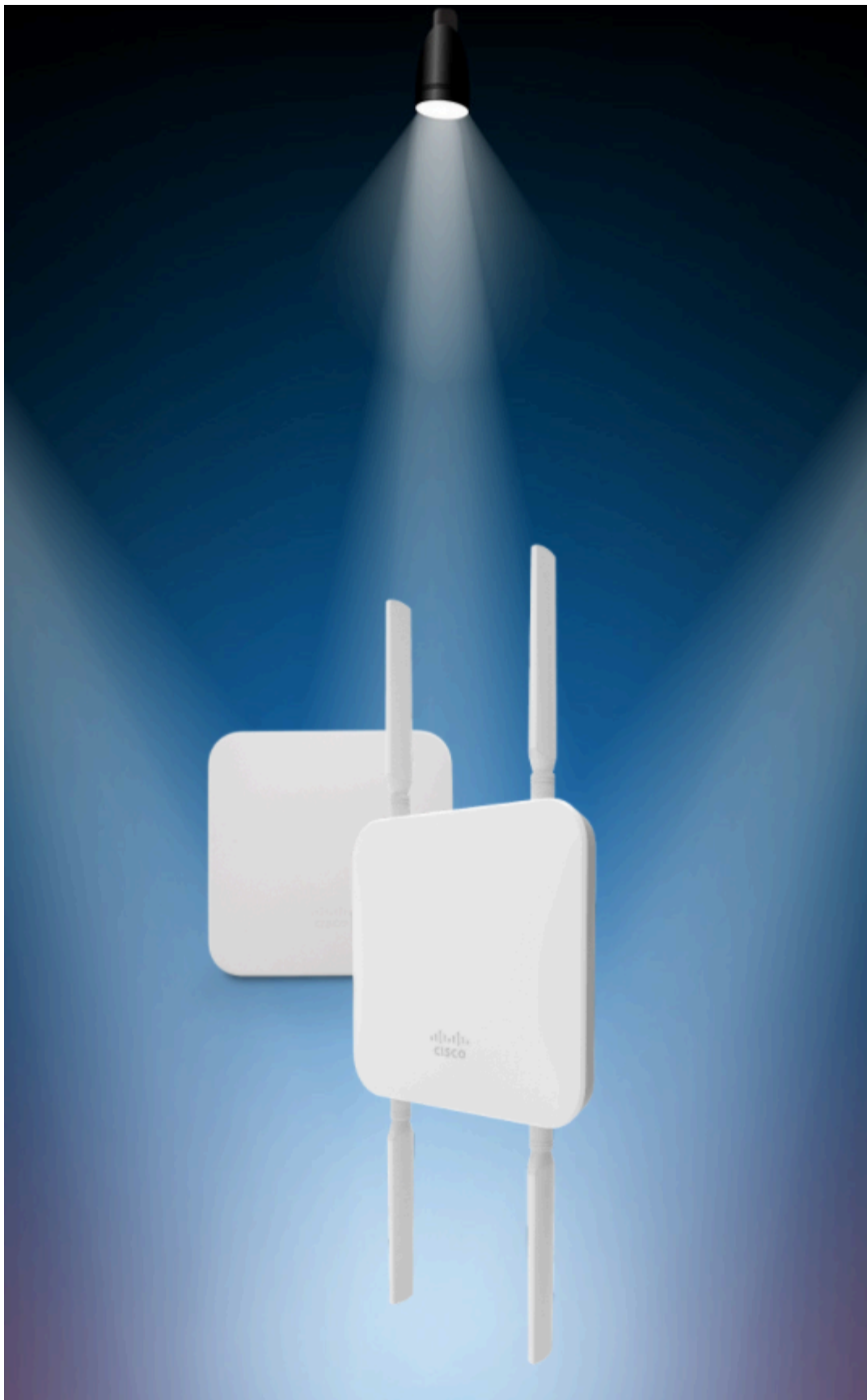
MG51 and MG51E cellular gateways